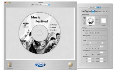
LaCie LightScribe Labeler Software